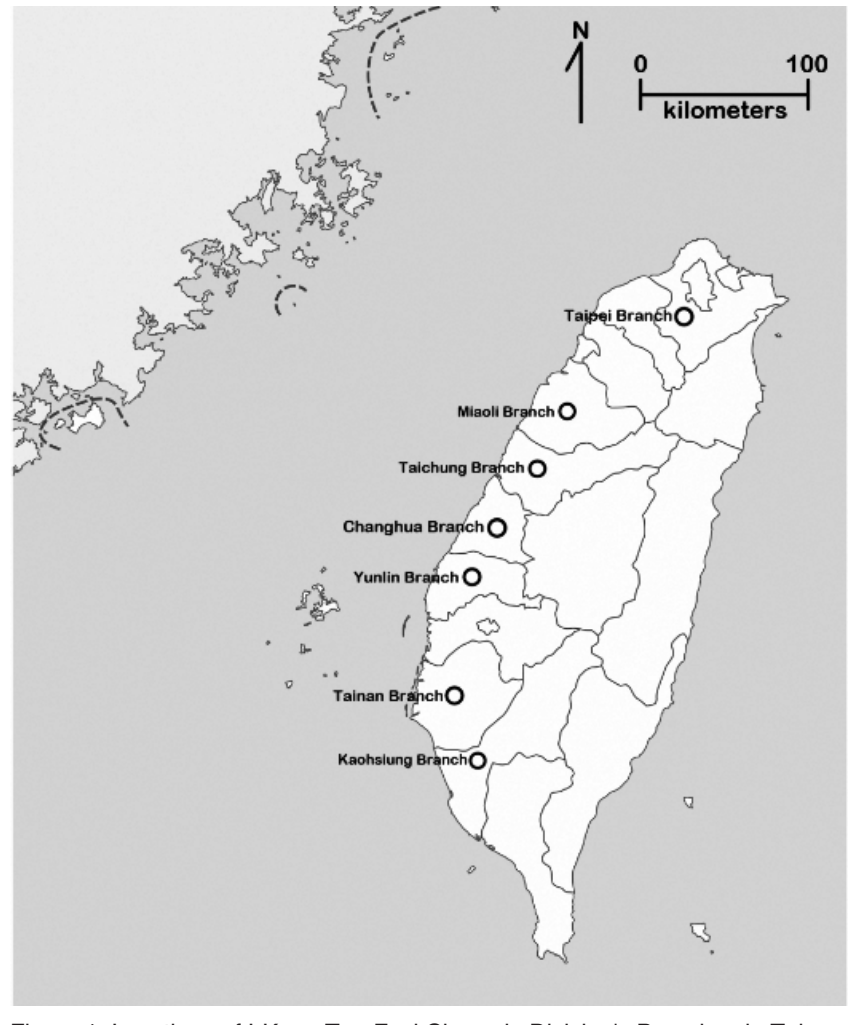
Figure 1. Locations of I-Kuan Tao Fayi Chongde Division's Branches in Taiwan

from rural areas to attend college in the cities. Intent on spreading the faith through the daily activities and networks of college students, she developed the Vegetarian Assembly (huoshituan 伙食團) as a new form of missionary practice. This usually takes the form of people renting an apartment together and cooking vegetarian food by rotation. In this way, the Fayi Chongde has attracted the largest